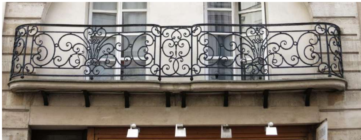
Balcony, 42, rue François Miron 75004 Paris