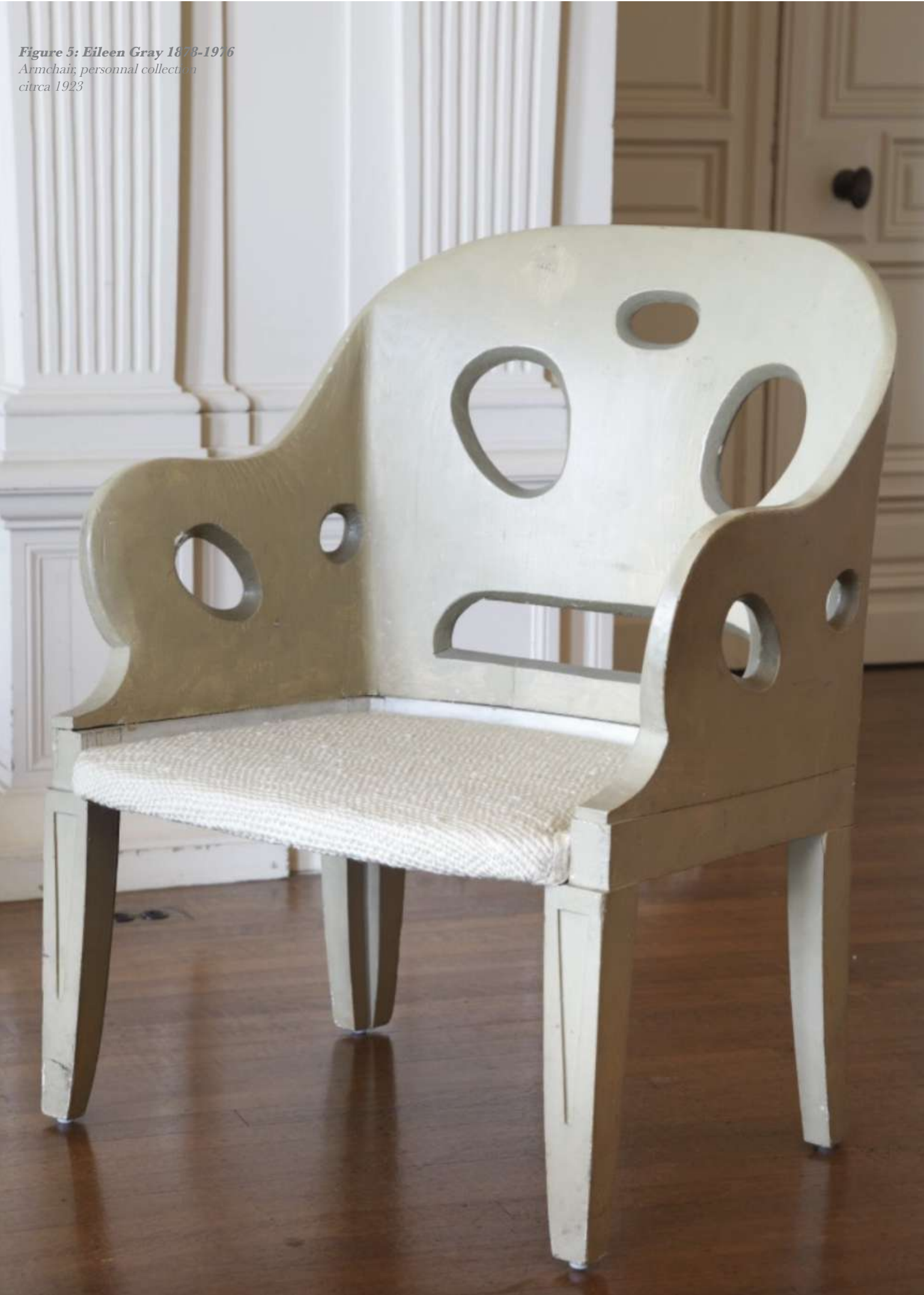
Figure 5: Eileen Gray 1878-1976 Armchair, personal collection circa 1923