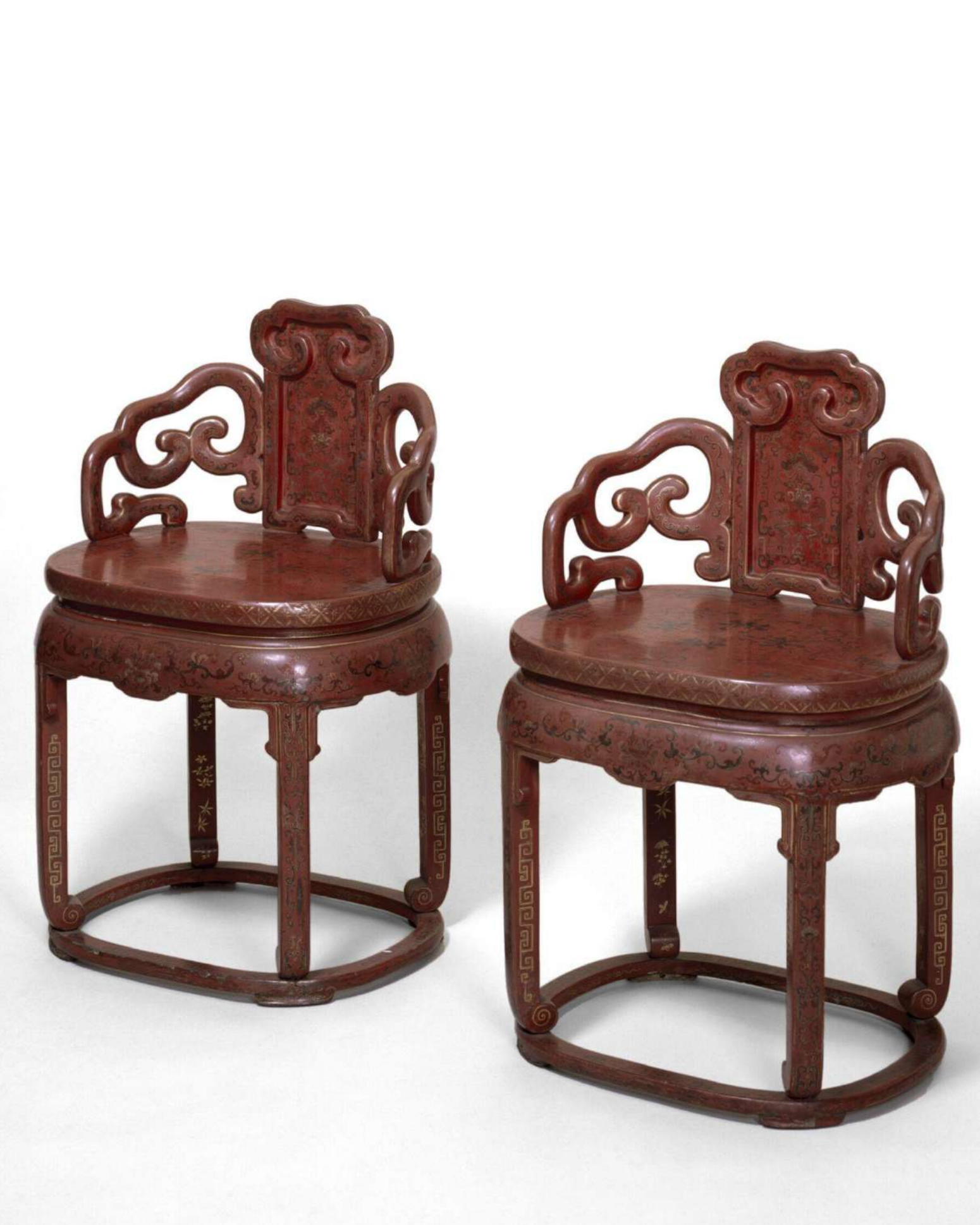
Figure 1: the Palace Museum, Beijing Kangxi