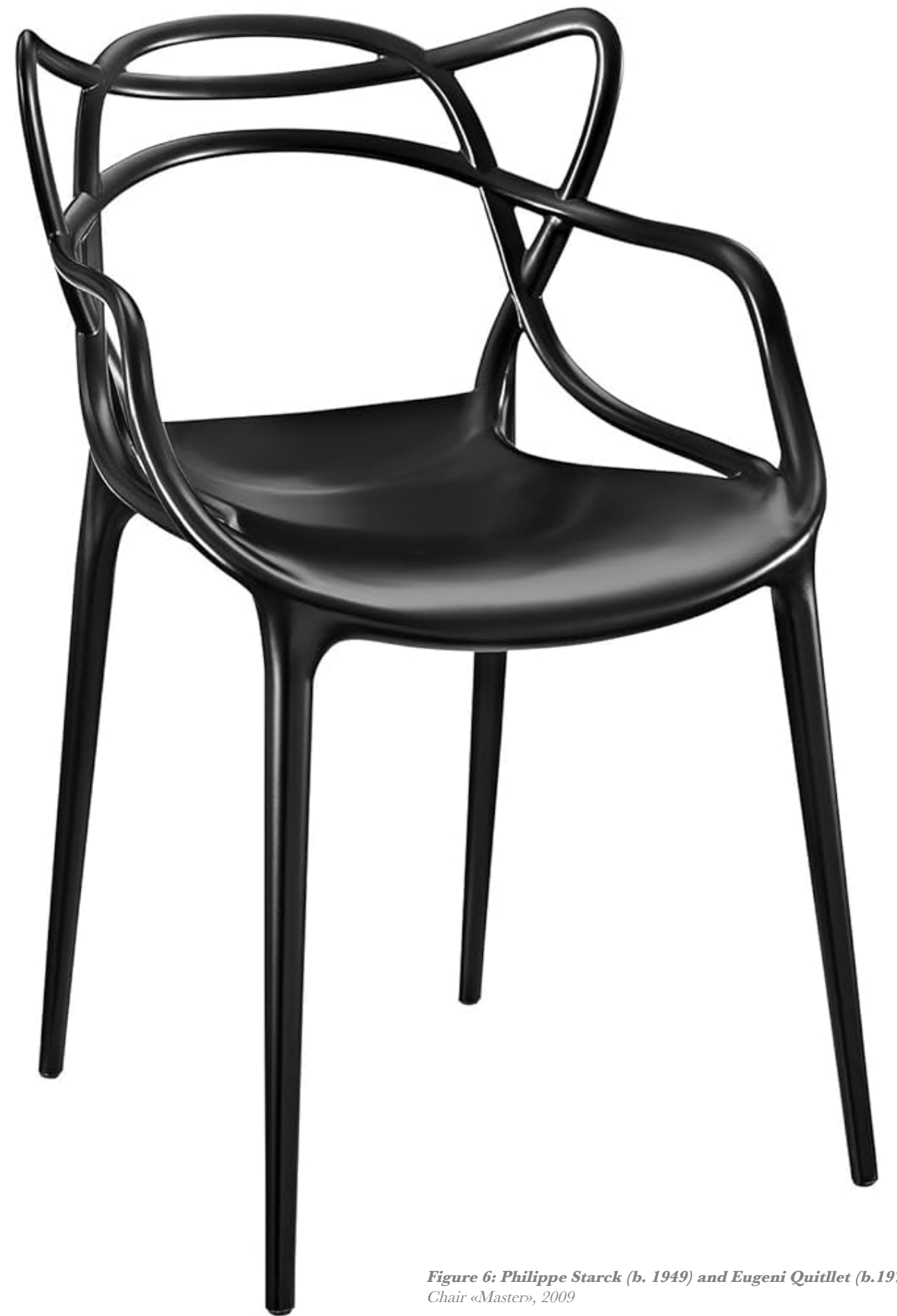
Figure 6: Philippe Starck (b. 1949) and Eugeni Quitlet (b.1972) Chair «Master», 2009