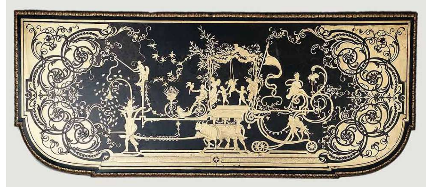
André-Charles Boulle (1642-1732), top plate of a pair of side table Wallace Collection London