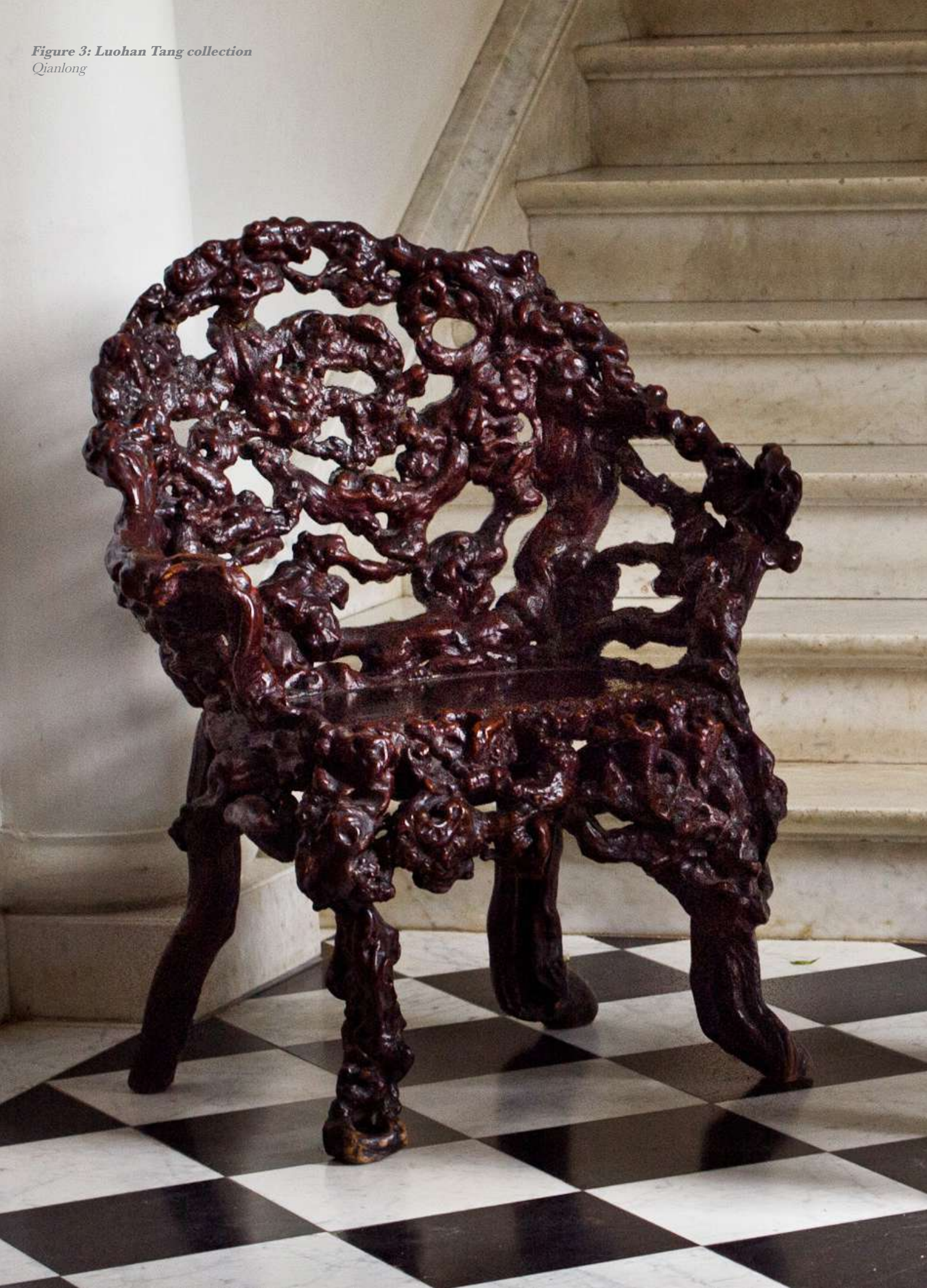
Figure 3: Luohan Tang collection Qianlong